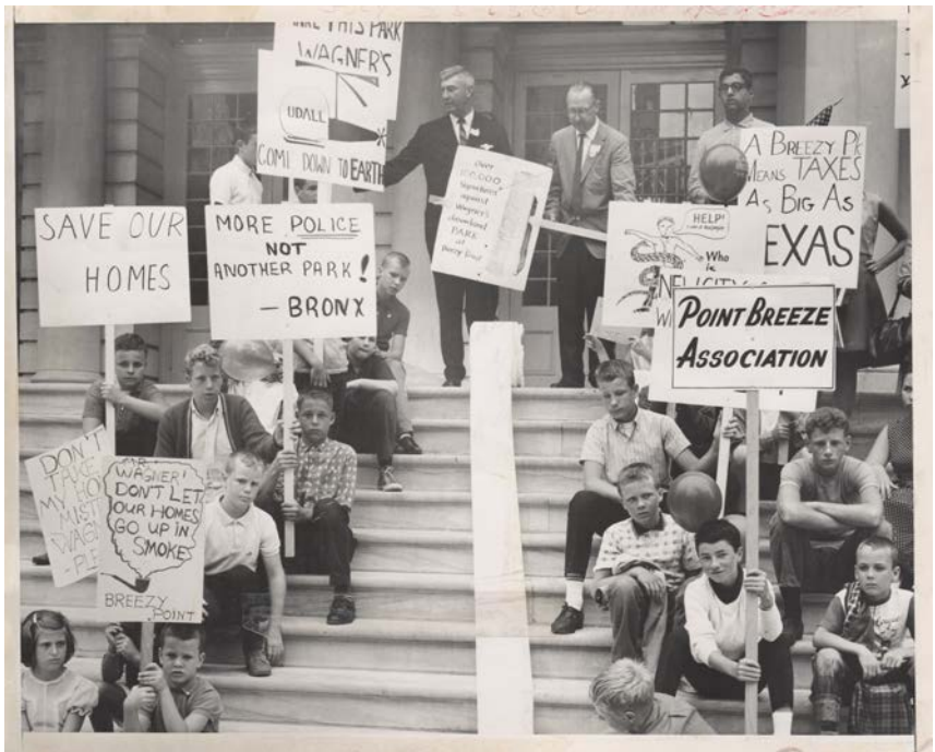
1963 City Hall Protest