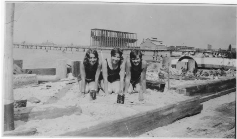
Park End Coal Pier (Roxbury)