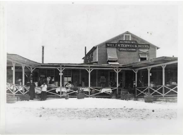
Nils Friberg Hotel (Rockaway Point)